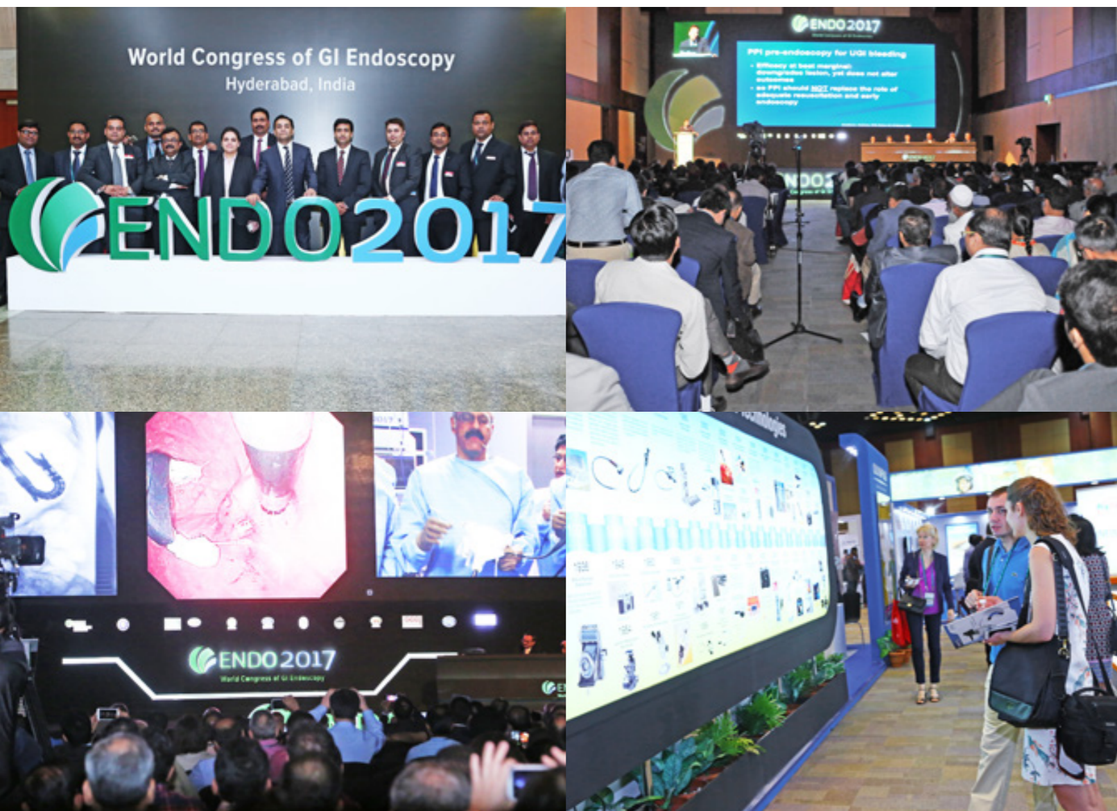
The robust scientific program with participation of 234 faculty members and support of 10 major endoscopy societies was key to the success of ENDO 2017. Parallel scientific sessions, comprehensive hands-on training and three days of live endoscopy sessions with over 52 cutting-edge procedures were performed and assisted by 70 world renowned experts.

In 2014, the WEO Executive Committee chaired by Dr Nageshwar D. Reddy decided that it was time to address the growing need of a specific meeting framework for endoscopy. The 1 st World Congress of GI Endoscopy, ENDO 2017, took place in Hyderabad, India. During three and a half days and with the attendance of more than 3,500 delegates from 78 countries worldwide, ENDO 2017 was very successful in responding to the increased need of specialized training and attracting contributors from the Asia-Pacific countries.